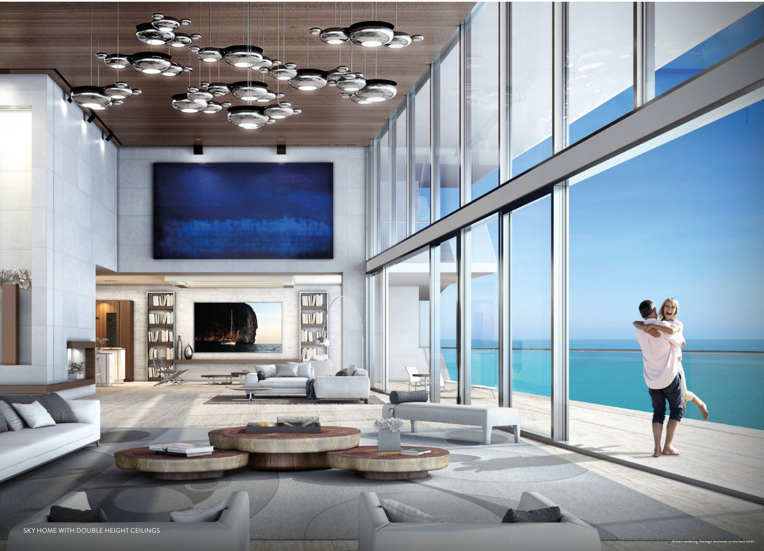
SKY HOME WITH DOUBLE HEIGHT CEILINGS

Artist's rendering. See legal disclaimer on the back cover.