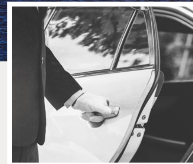
PORTE COCHÈRE ARRIVAL

Artist's rendering. See legal disclaimer on the back cover.