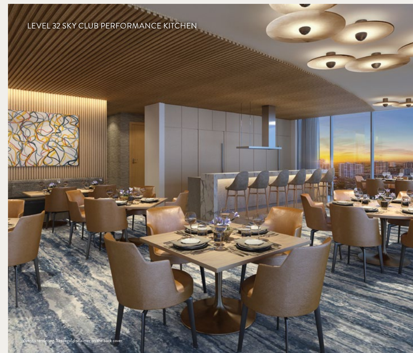
LEVEL 32 SKY CLUB PERFORMANCE KITCHEN

Artist's rendering. See legal disclaimer on the back cover.