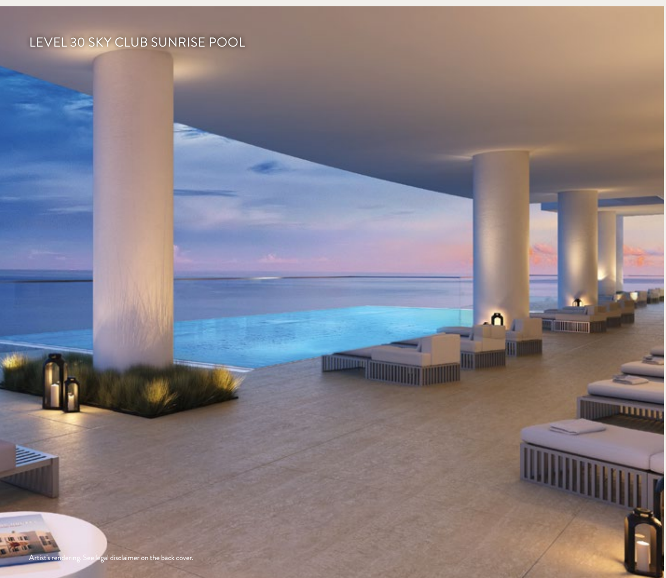
LEVEL 30 SKY CLUB SUNRISE POOL

Artist's rendering. See legal disclaimer on the back cover.