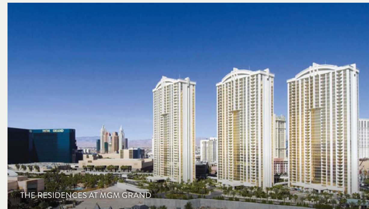
THE RESIDENCES AT MGM GRAND