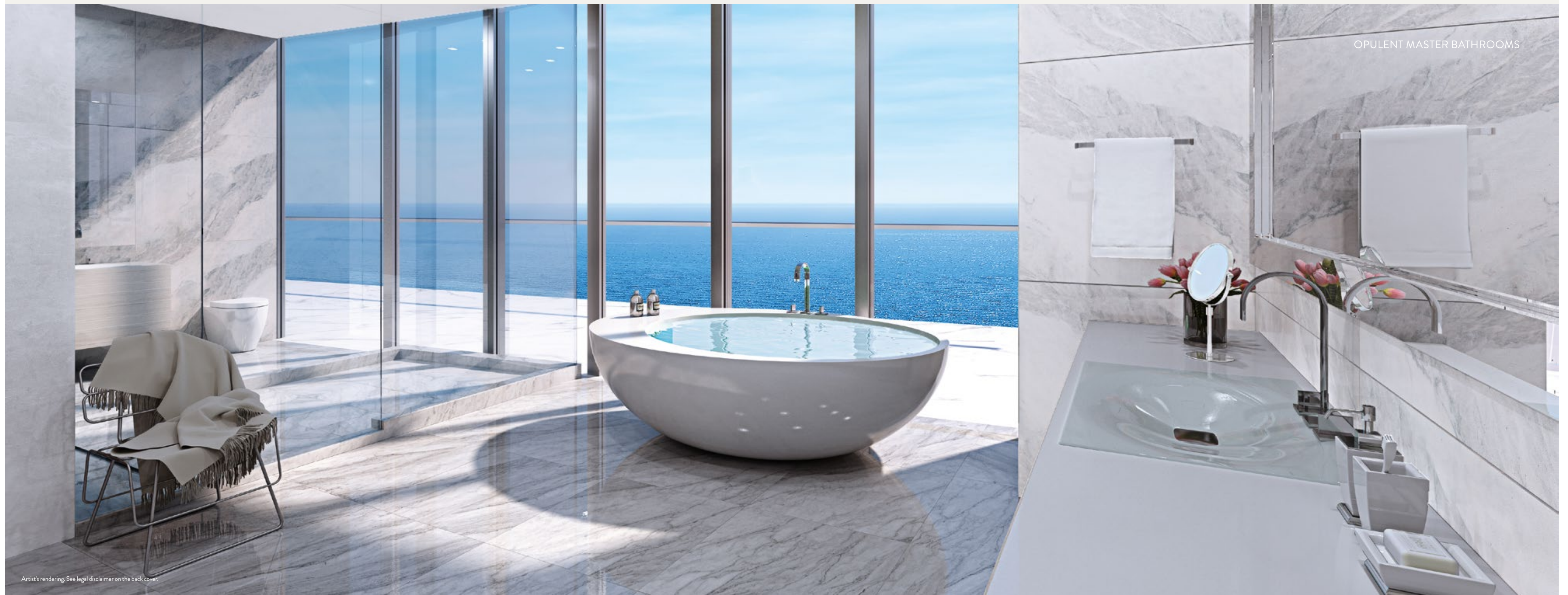
OPULENT MASTER BATHROOMS

Artist's rendering. See legal disclaimer on the back cover.