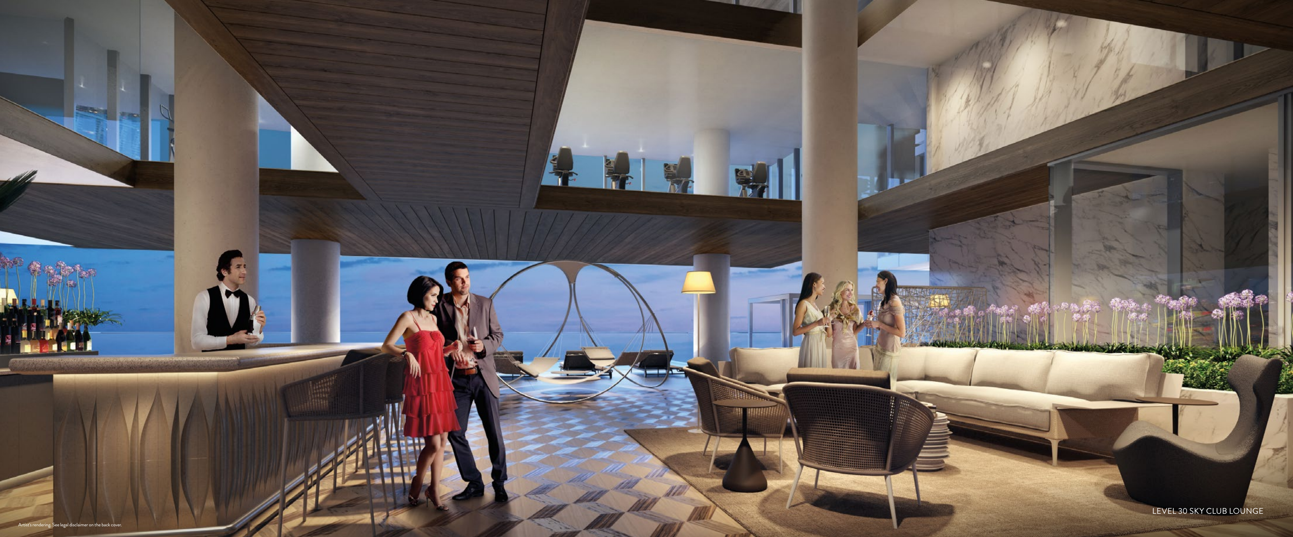
LEVEL 30 SKY CLUB LOUNGE

Artist's rendering. See legal disclaimer on the back cover.