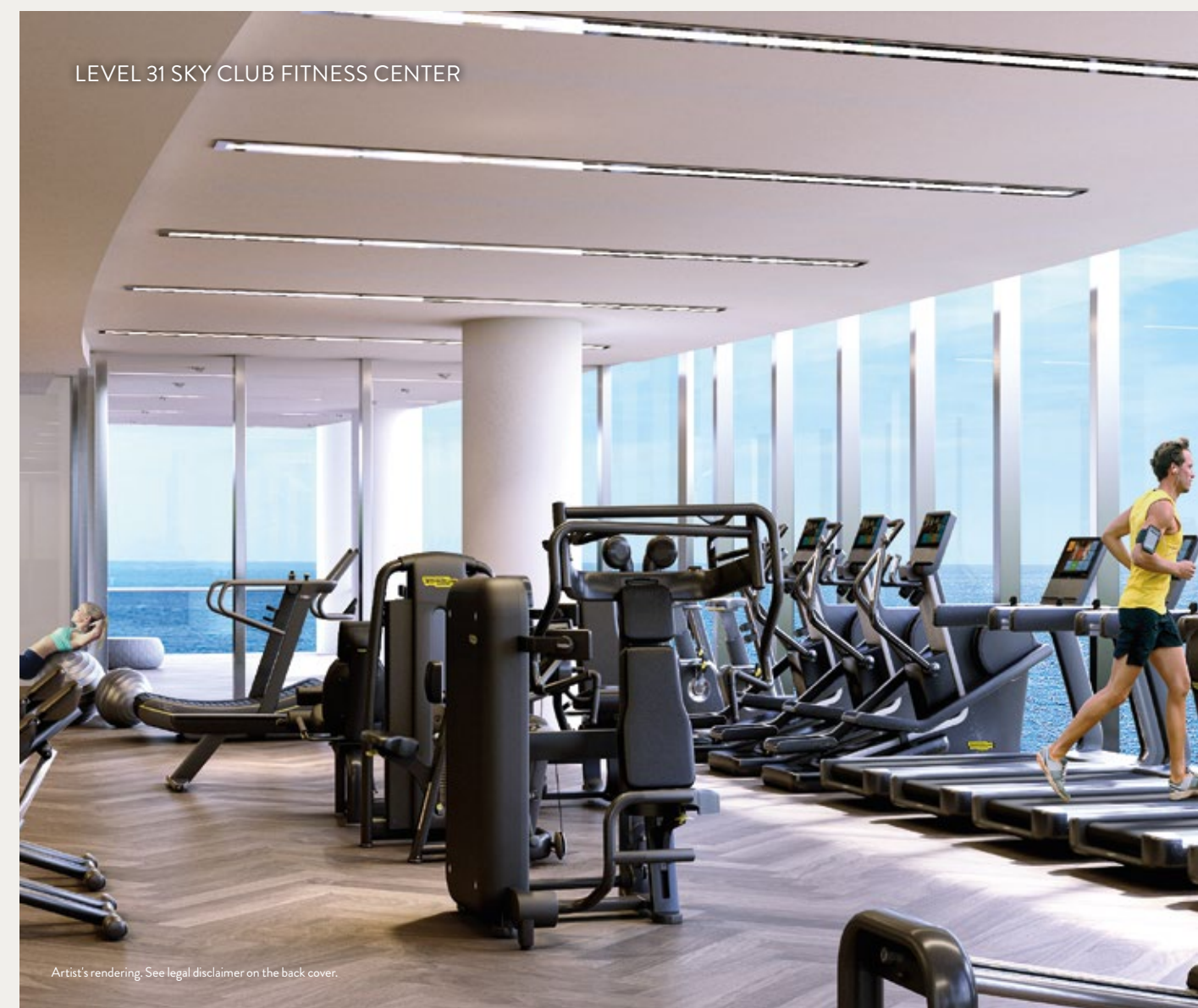
LEVEL 31 SKY CLUB FITNESS CENTER

Artist's rendering. See legal disclaimer on the back cover.