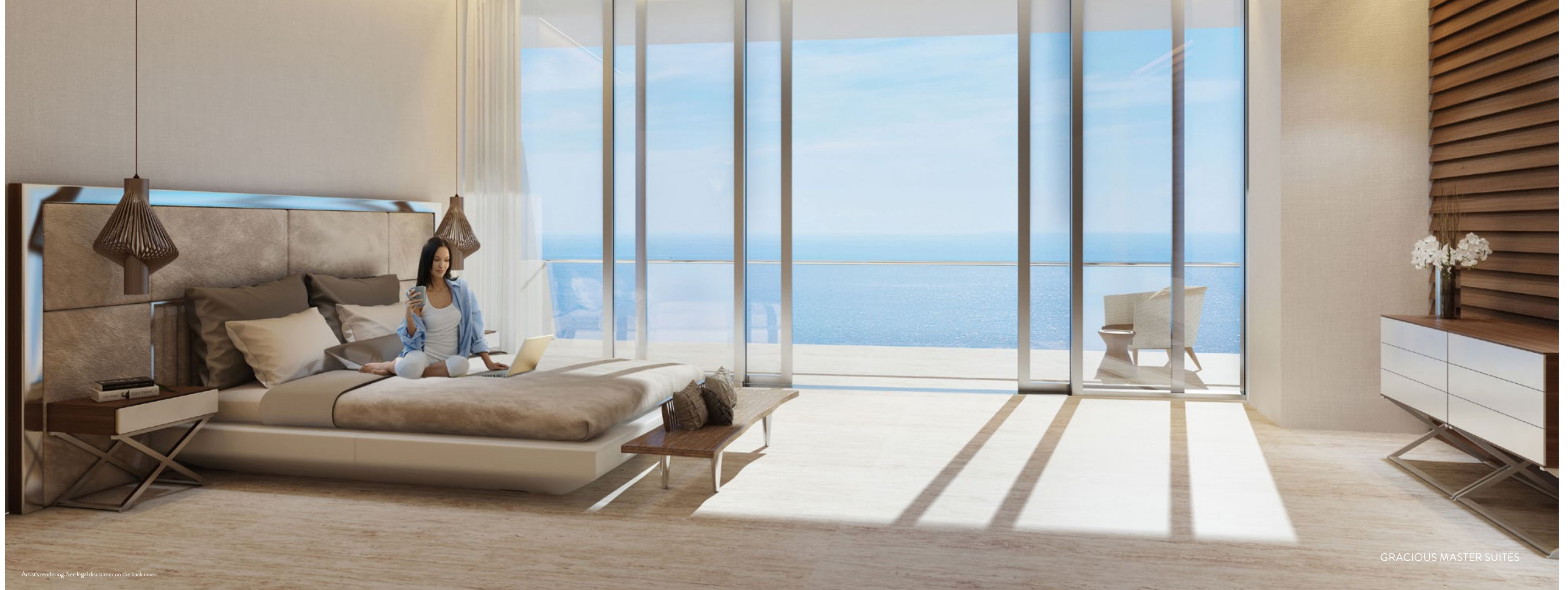
GRACIOUS MASTER SUITES

Artist's rendering. See legal disclaimer on the back cover.