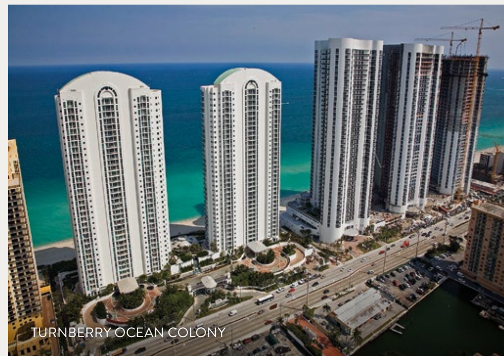
TURNBERRY OCEAN COLONY